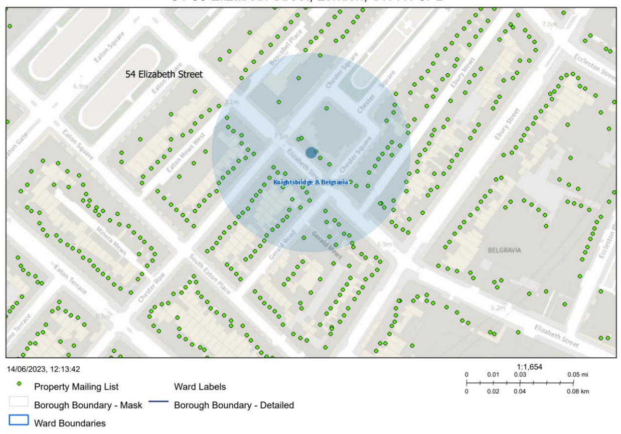
54-56 Elizabeth Street, London, SW1W 9PB